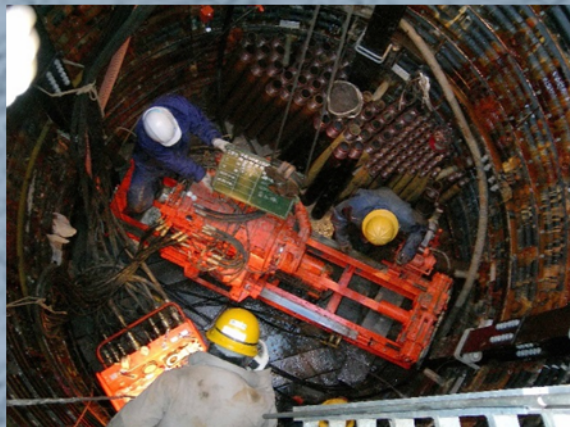
Drilling of horizontal dewatering hole for land slide prevention