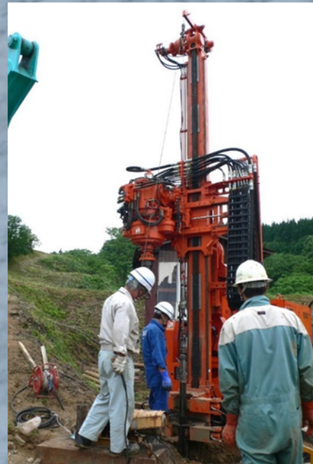
Investigation drilling for land slide restraint