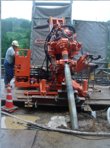
Anchoring for land slide prevention