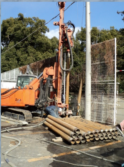
Drilling of underground geothermal hole at international school